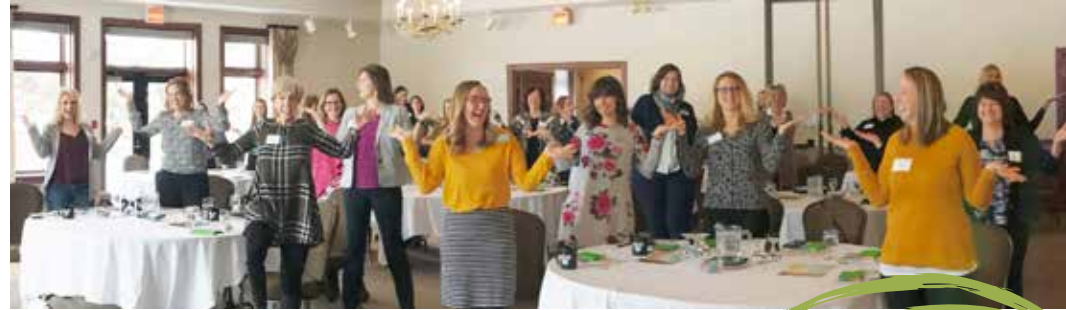
Participants demonstrating the International Women's Day 2019 Theme #BalanceforBetter

The Women's Fund celebrated International Women's Day at Philanthropy Matters , on March 7, 2019 at Butte des Morts Country Club.