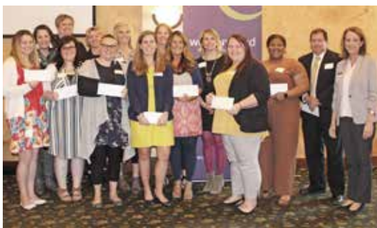
2019 Project Grant Recipients

Provides elementary school girls with opportunities for physical activity and social-emotional skill development during a one-week summer program that teaches life skills and promotes holistic health outcomes for girls.