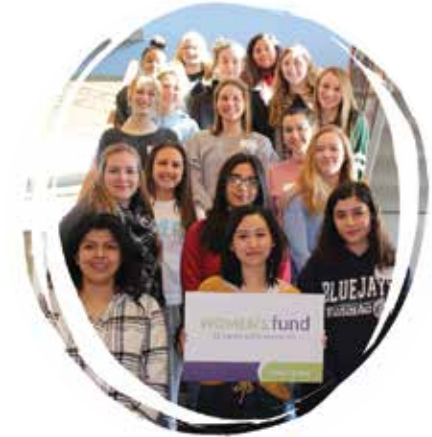
2019 Girls' Grantmaking Project Participants

At the end of the program, they awarded $10,000 in grants to the following programs.