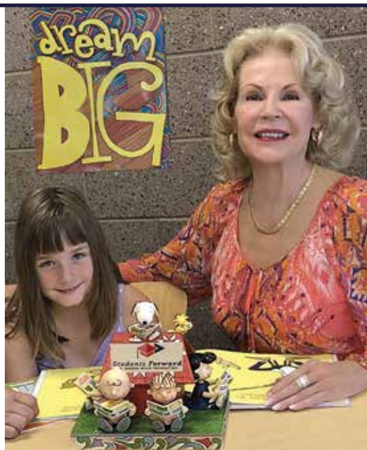
Boys and Girls Club Page Turners Literacy Tutoring Program

Proudly supporting the Women's Fund for the Fox Valley Region, Inc.