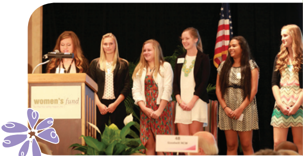
Representatives from the 2014 Girls' Grantmaking Project address the audience at the September 11, 2014 Women's Fund Luncheon. This year's group from Kaukauna and Kimberly high schools identified preserving self-confidence and improving access to opportunities as their priorities.

"The best part of this experience was learning more about what our community needs – opening my eyes a little wider."